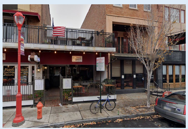
Collaboration with an adjacent business